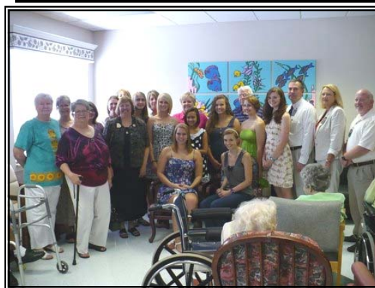
Pictured are members of the Bainbridge High Anchor Club, The Pilot Club of Bainbridge, and staff of Memorial Hospital and Manor in Bainbridge. They received one of the Hospital Art pictures from the 2010-2011 Anchor Convention.