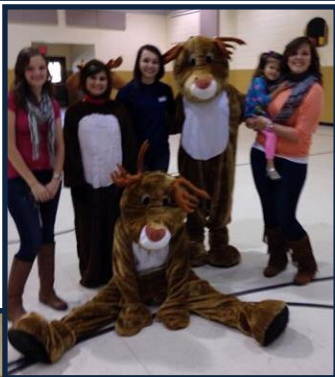
East Laurens' Anchors helped out with a BrainMinders event at East Laurens Primary School