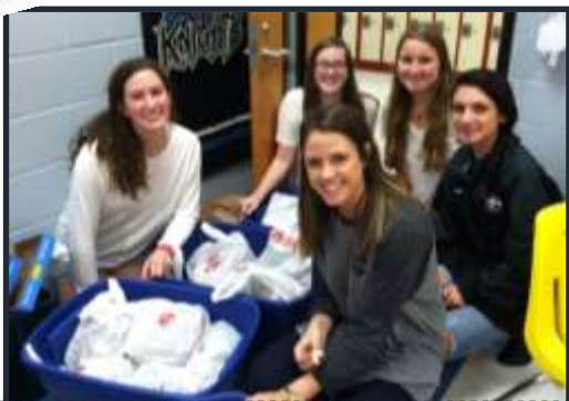
Centennial HS Anchors packing for Blessings in a Backpack