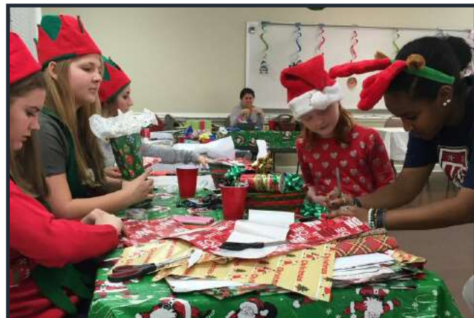
Roswell & Centennial HS Anchor Elves wrapping gifts at Santa's Workshop