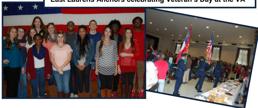
East Laurens Anchors celebrating Veteran’s Day at the VA