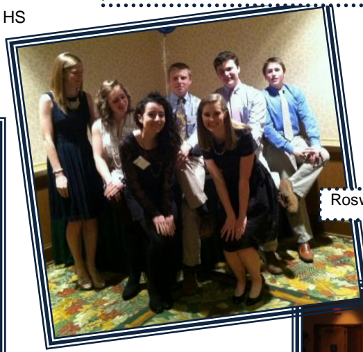
Roswell High School Anchors