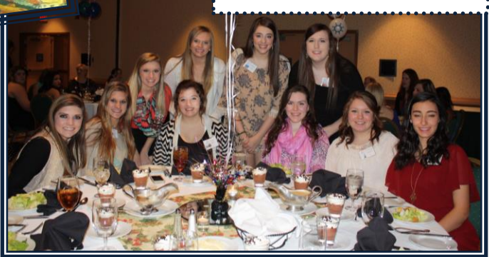
John Milledge Academy Anchors