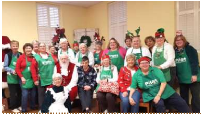
Annual Pilot Club of Covington's Santa's Breakfast & Shop