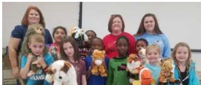
Pilot Club of Eastman's members present BrainMinders at the South Dodge Elementary School