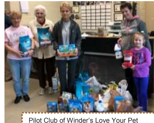
Pilot Club of Winder's Love Your Pet Day project. They made donations to the local Barrow County Animal Shelter.