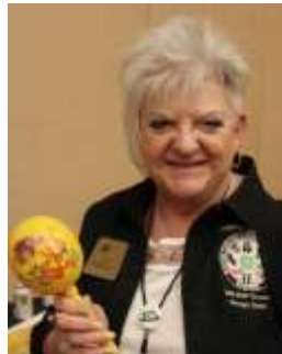
Governor Jayne enjoys the Anchor Cultural Exchange during the PI Convention