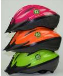
Pilot International Signature Safety Helmets

For more information, go to the Pilot International website: www.pilotinternational.org