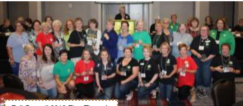
Fall Council 2019 First Timers!