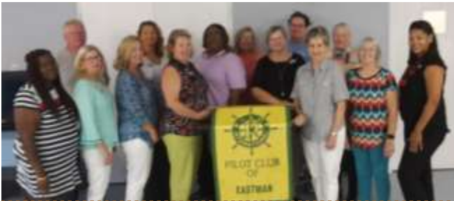
Pilot Club of Eastman held their annual prospective new member brunch and had 7 guests to attend.