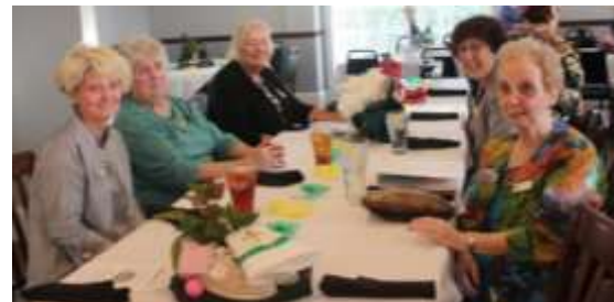
Oconee Co. Pilots attended the Classic City Founders Day