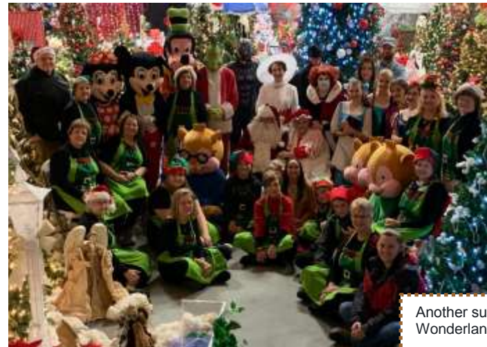
Another successful Pilot Club of Cochran's Winter Wonderland Express 2019. Great job! Pilots & crew!