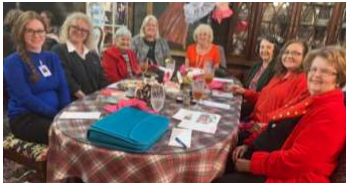
Battlefield Pilot Club had a tea on the National Girl's Night Out the night before Valentine's Day.