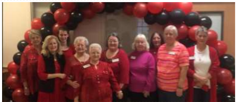
Pilot Club of Cairo's Valentine Party for Grady County Senior Citizens Center