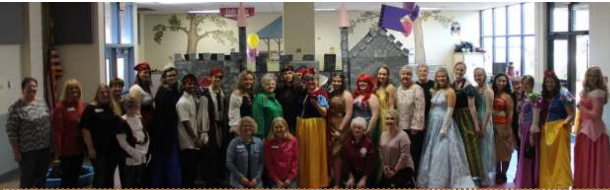
Pilots, Madison County and Franklin Anchors participated in 1st Annual Pilot Club of Madison County Princess and Pirate. Great friendship and service to our communities!