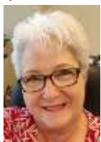
Robin Robin Williams